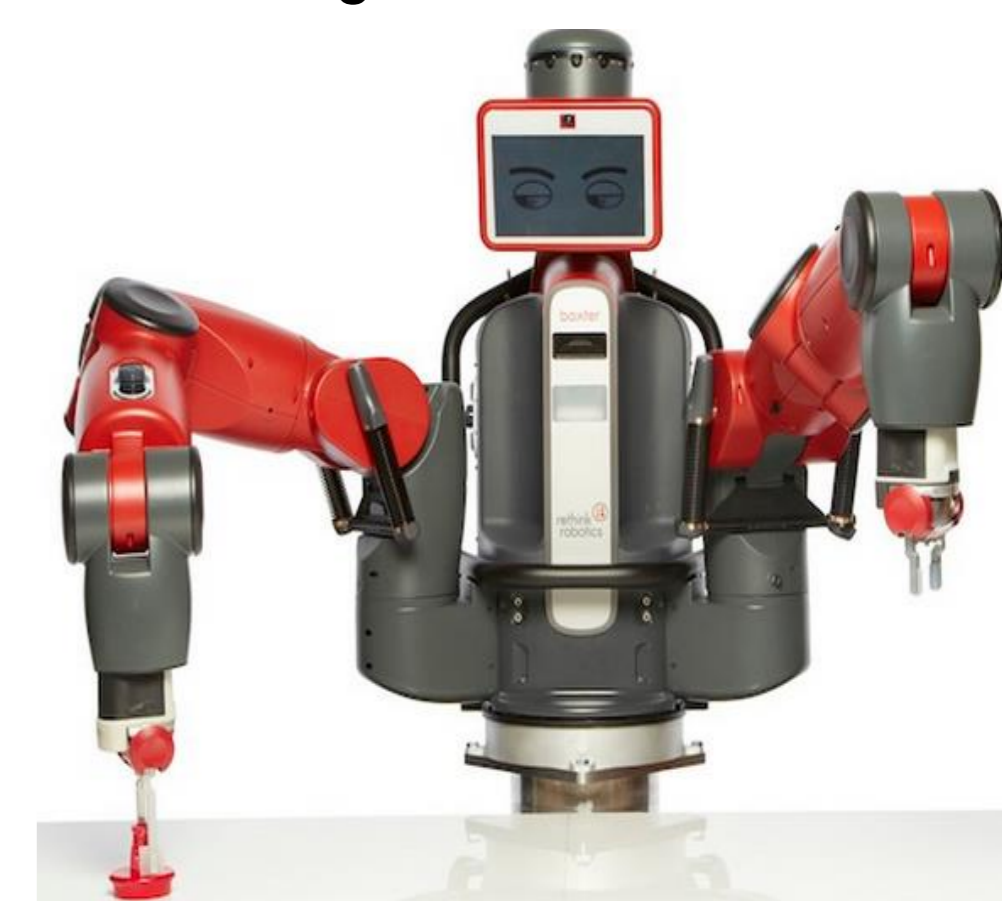
Figure 4: Test platform- Baxter Robot

Sensing and perception are essential capabilities for any robotic systems to sense, understand and interact with the environment/humans in real time. This project aims to develop key sensing and perception modules for improving the productivity of all stages of robotic welding/finishing processing of the industrial robots.