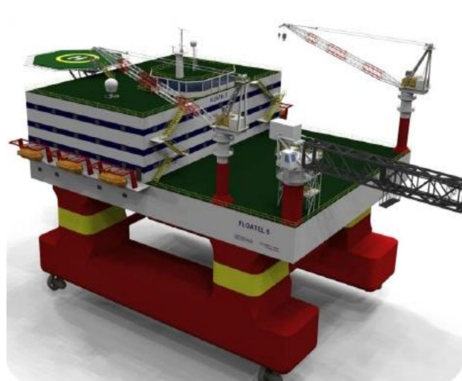
Figure 2: A floatel system

Offshore operations have been moving towards ultra-deep waters, more challenging environment and arctic areas where richer resources are detected and to be mined. One of the unavoidable challenge we have to cope with is the large amount of shielding effects due to Floating Production Storage and Offloading (FPSO) in the vicinity.